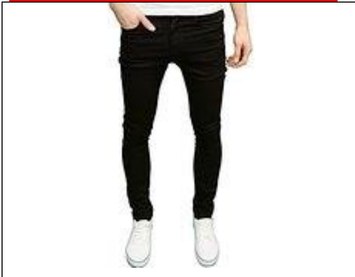
Black skinny fit/jean like