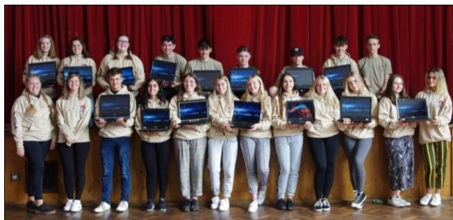
KHS Expedition July 2018 – students and laptops all set for departure!

In November 2017, the Kesgrave High School Expedition Team started an ambitious project to collect old, unwanted and broken laptops and turn them into useful learning tools that could be taken to South Africa and donated to communities in desperate need of teaching and learning resources. Following our original appeal for donated equipment, the Team were overwhelmed with the positive response from the Kesgrave High School community.